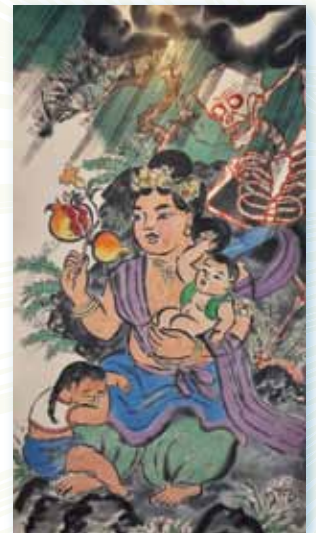
"Hariti," scroll by Mayumi Oda, courtesy of Ren Brown Collection. © 2010 by Mayumi Oda.

from The Essential Rumi , © 1995 by Coleman Barks